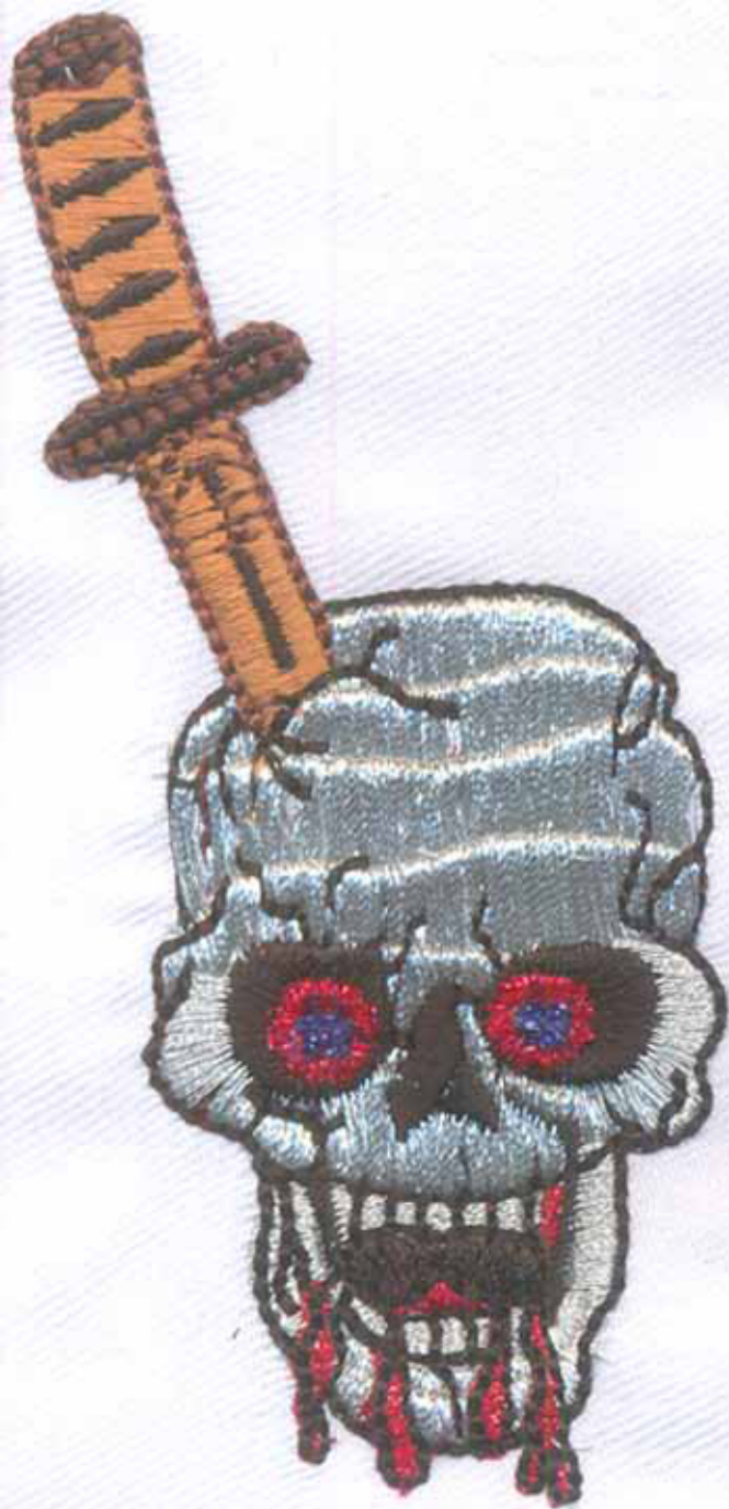
Skull 15.dst (W 5.50 x H 10.91) cm 12,470 stitches 6 colours