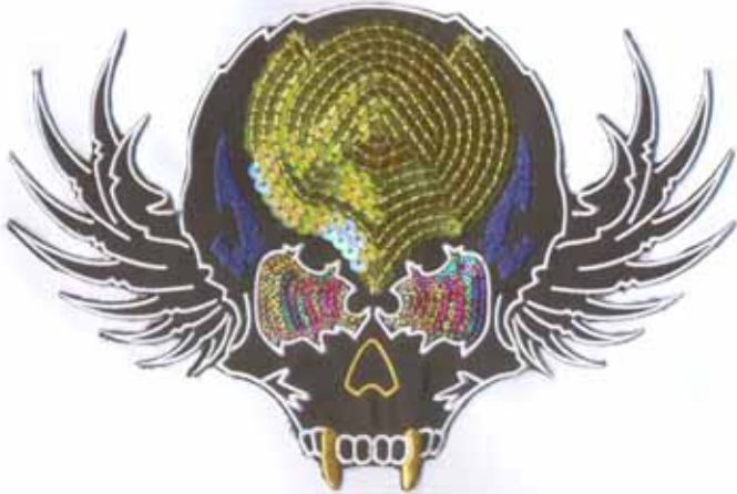
Skull 6.dst (W28.08 x H 18.81) cm 38,671 stitches 7 colours