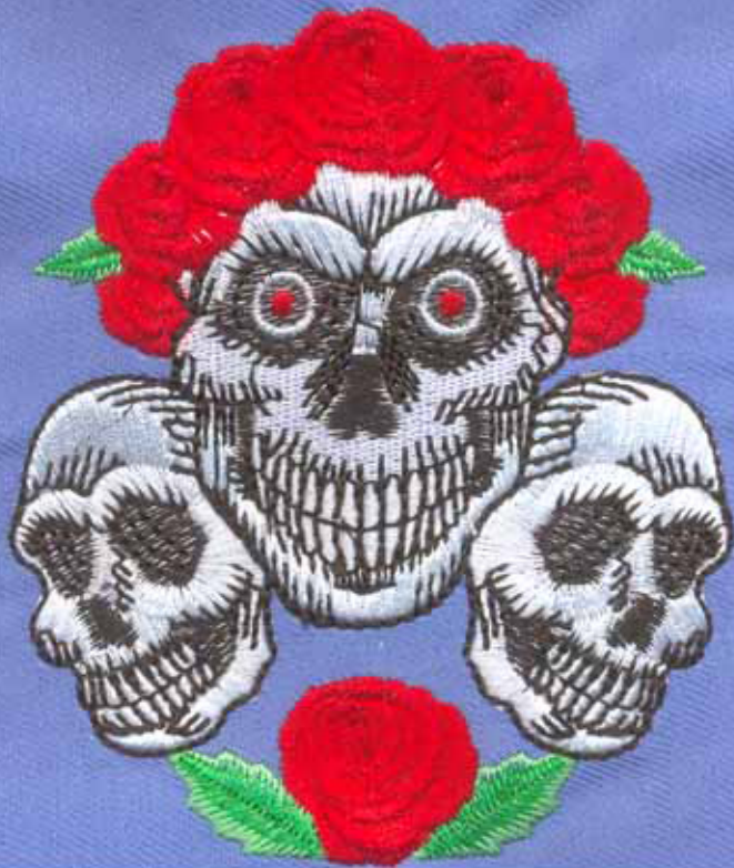
Skull 10.dst (W9.04 x H 10.83) cm 30,394 stitches 7 colours