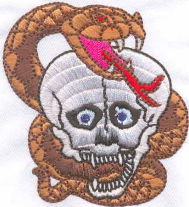
Skull 14.dst (W 7.54 x H 8.55) cm 19,470 stitches 10 colours