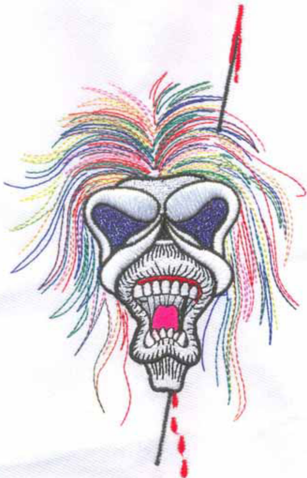
Skull 12.dst (W9.76 x H 15.01) cm 18,667 stitches 5 colours